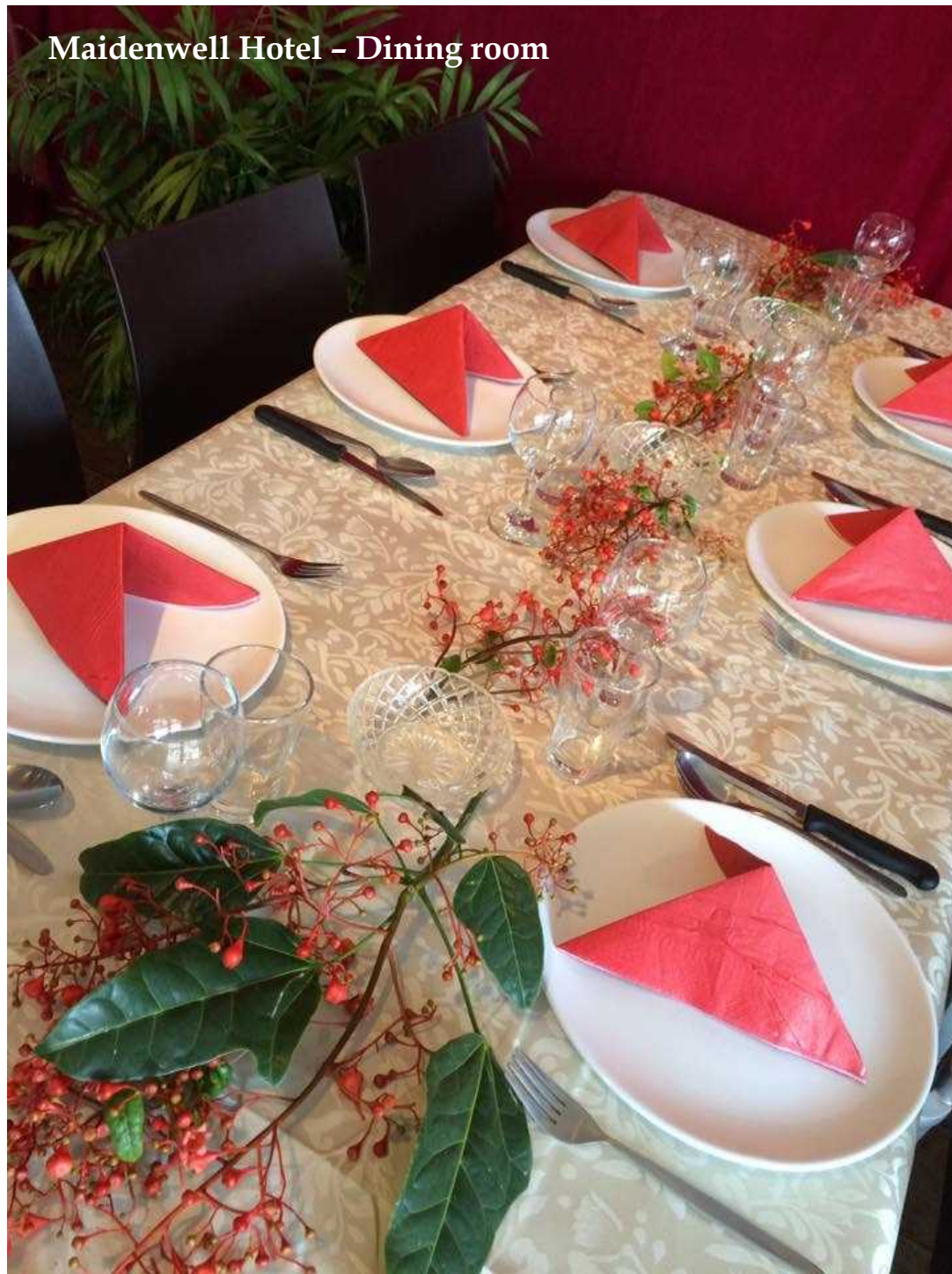
Maidenwell Hotel - Dining room