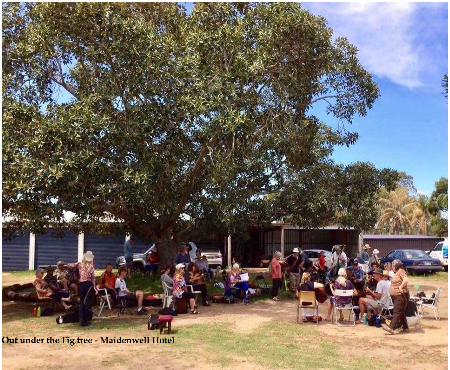
Out under the Fig tree - Maidenwell Hotel