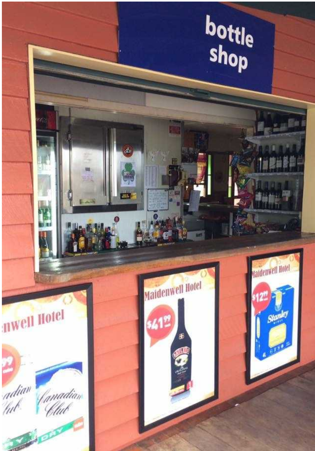
Maidenwell Hotel - Multi-purpose function area