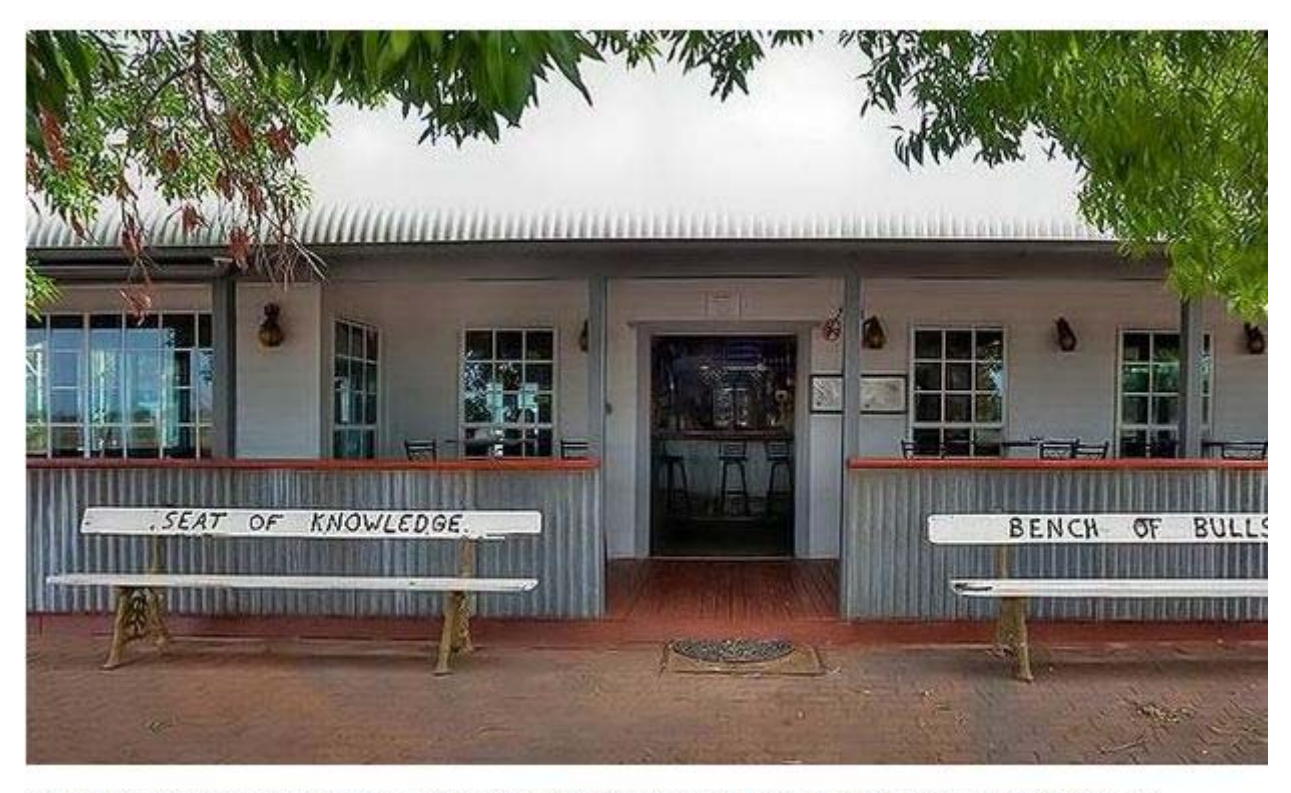
The Muckadilla Hotel has made it to a list of World's Secret Watering Holes on the New York Times this week